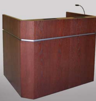
52" Wide Custom Oak with aluminum laminate narrow reveal. Reference MFI #62981