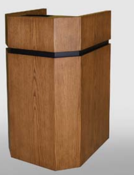
25" Wide Custom Oak, black painted reveal. Reference MFI #71191

Wedge Style lecterns have a distinctive deep reveal that can be finished in matching veneer, metallic laminates or colors. They are available with height adjust and either casters or levelers.