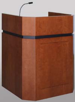
35" Wide Custom Cherry with rear access. Reference MFI #61812